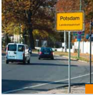
For Germany's first environment-sensitive traffic management system in Potsdam, TEU detectors provide helpful data