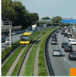
The traffic situation in the Ruhr area is monitored with the help of more than 600 detectors of the Traffic Eye Universal type