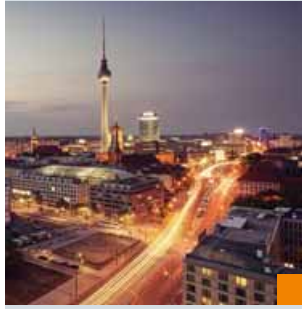
The Berlin traffic management center, too, relies on the valuable, accurate data provided by TEU systems